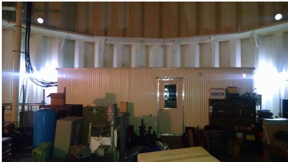
Lincoln Hill – Electronic Equipment Enclosure Base of Water Tank

ANSWER – Kitsap 911 not have any documents concerning the water tank and tower at the Lincoln Hill site. Several photographs are below.