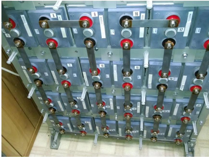
Lincoln Hill – DC Power Plant Batteries