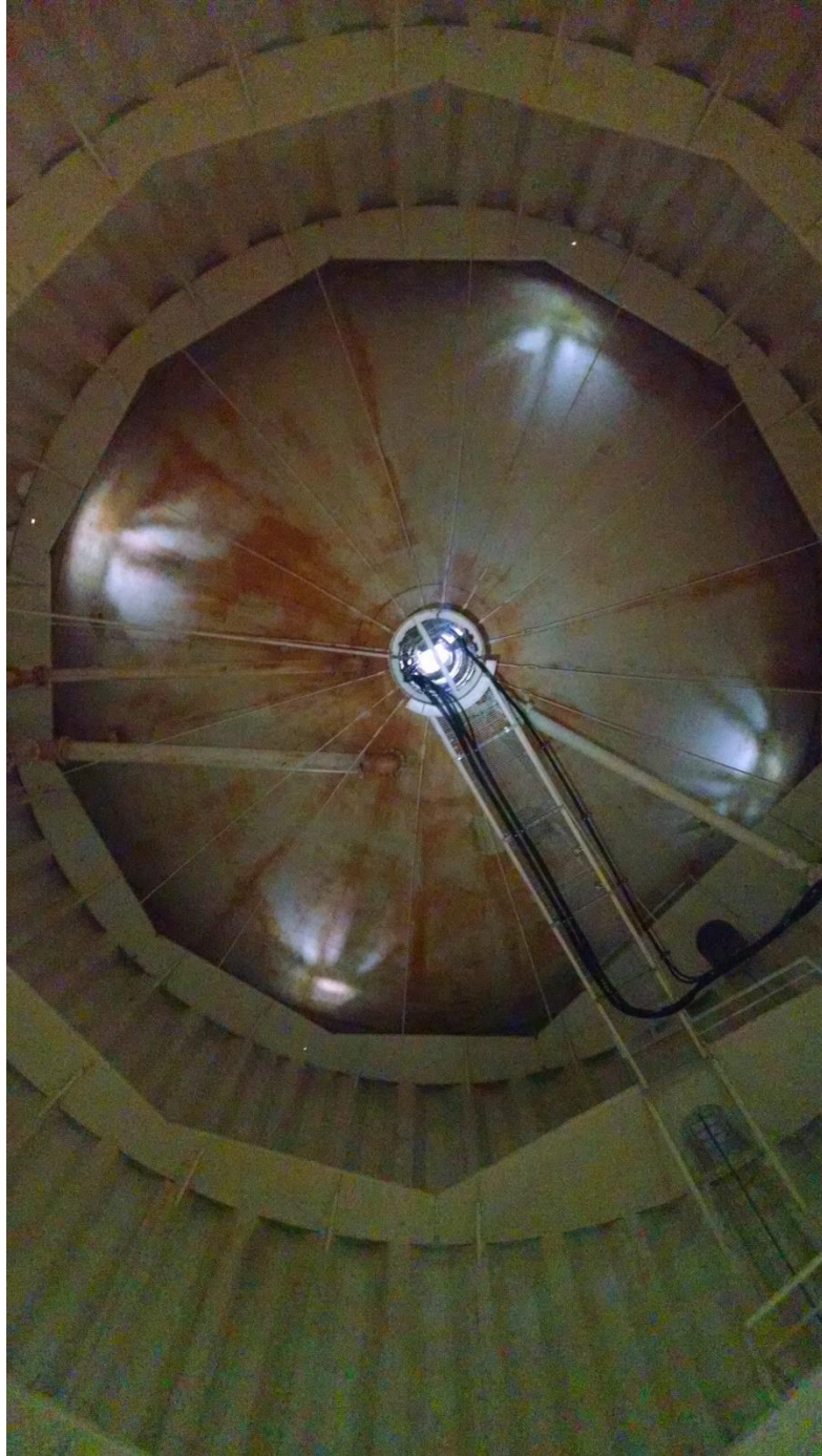
Lincoln Hill – Looking Up Toward Bottom of Water Tank Waveguide Ladder Rack