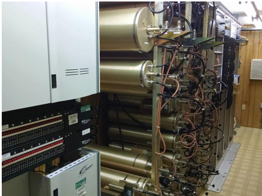
Lincoln Hill – Microwave Radio Equipment Rack & Combiners