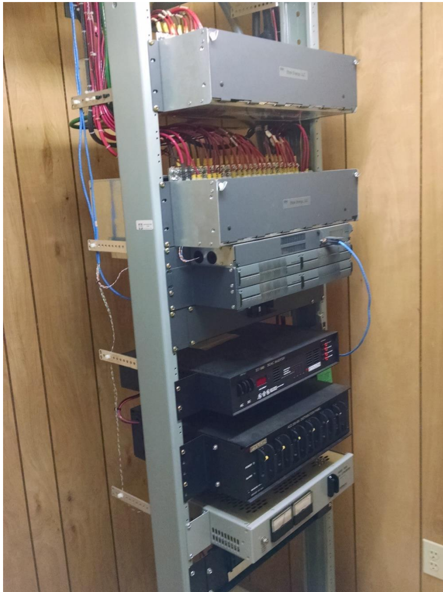
Lincoln Hill – DC Power Plant